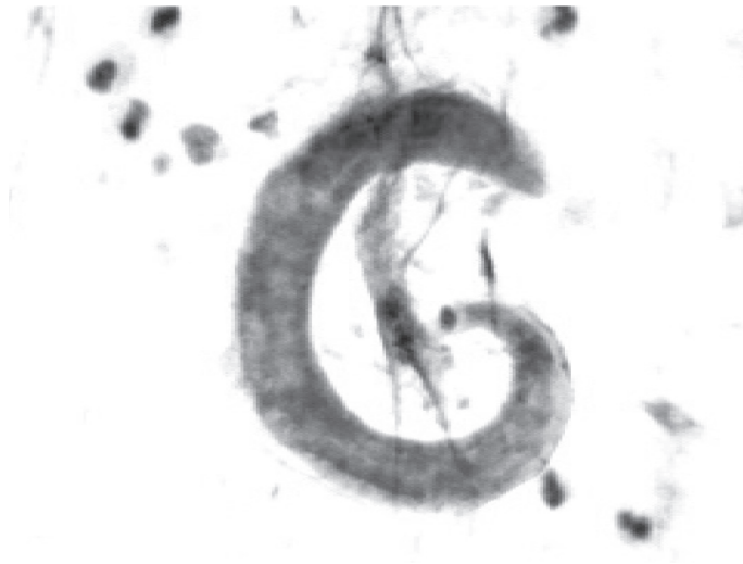
Figure 3. BAL revealing Strongyloides larvae and polymorphonuclear neutrophils